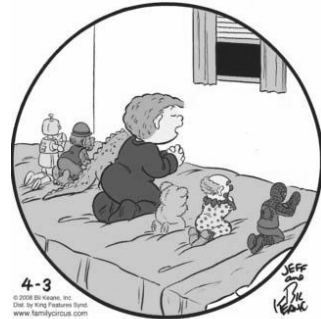
"Bless us all."